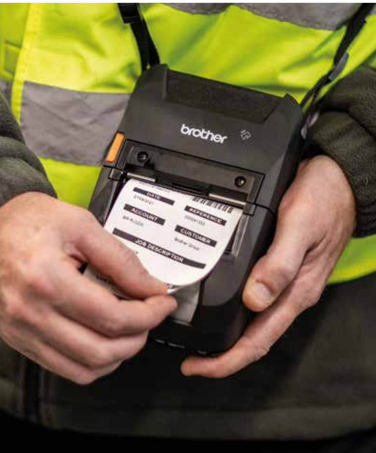
* Check model compatibility